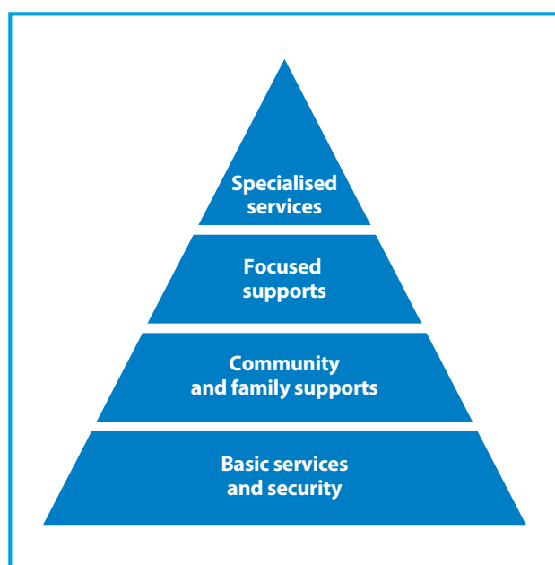
Figure 1. Intervention pyramid for mental health and psychosocial support in emergencies.

According to the Emergency Obstetric and Newborn Care (EmONC) needs assessment, only 16.8% of the expected deliveries take place in health facilities and only 6.5% in facilities able to respond to a possible complication. There are remote areas of the country where only 2.7% of major direct obstetric complications are assisted in adequate facilities. The guarantee of assistance to women is not only undermined by the availability of very few facilities with acceptable levels of care, but also